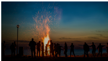
Standard Dynamic Range