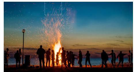
High Dynamic Range