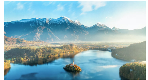
Maximum: 4000-6000 nits